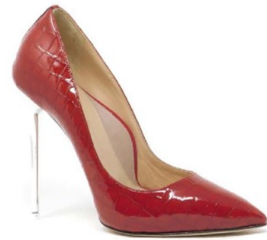
New Taryn Crocco Red