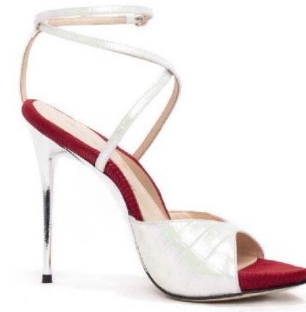
Sheena White Crocco