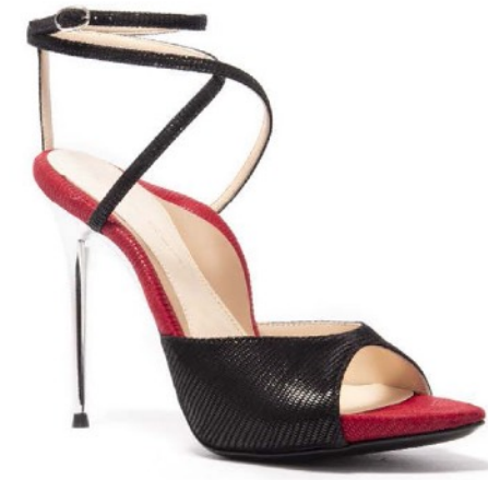
Sheena Black Verano