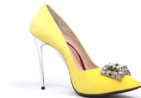
New Taryn Yellow with Ice