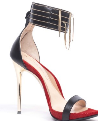
Stepheny Black Nappa