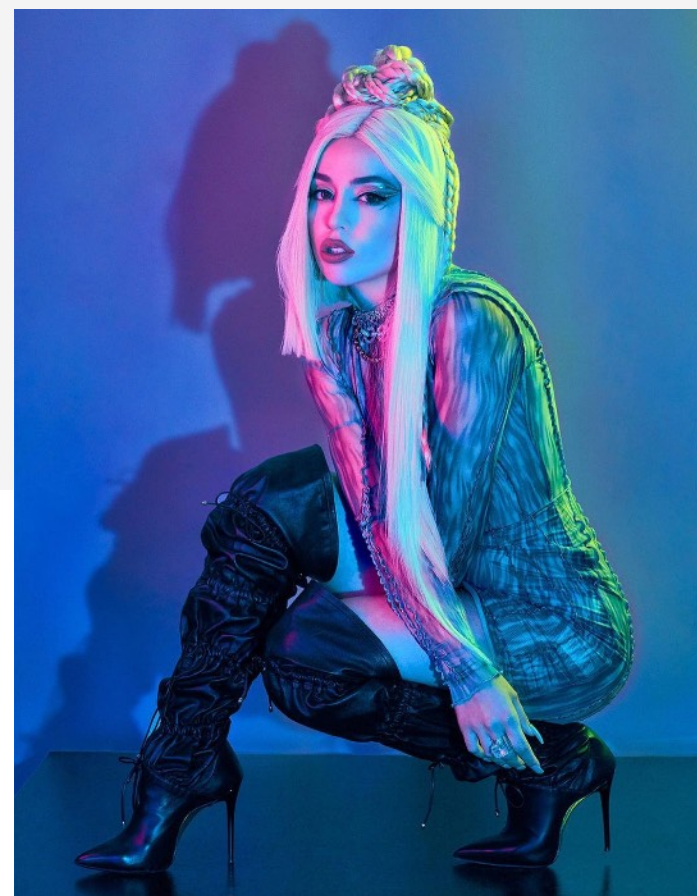
Ava Max posing on our New Alaya Foulard Nappa boots.