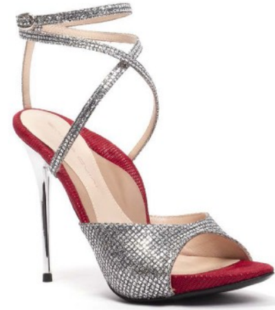
Sheena Rock Sparkle