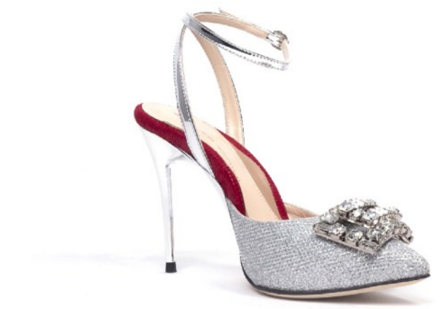
Nina Silver Glitter with Ice