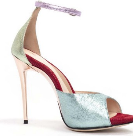
Chiara Aegan Water