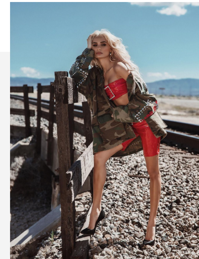
Pia Mia posing for Modeliste Magazine wearing our New Taryn Black Patent heels.